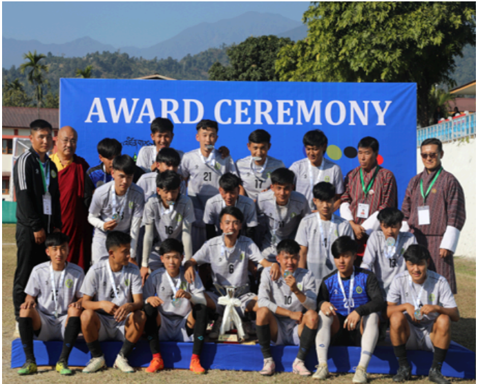
Figure 7. Glimpse of Football Final, Men (PCE winner, JNEC runner-up)