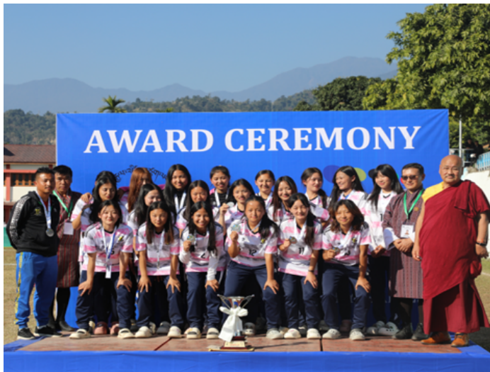
Figure 8. Glimpse of Football Final, Women (PCE winner, SC runner-up)