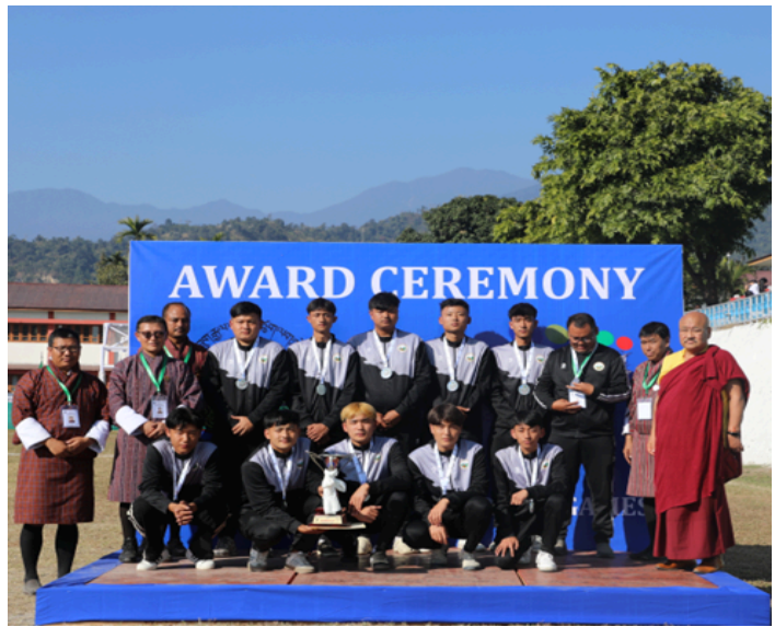
Figure 5. Glimpse of Basketball Final, Men (GCBS winner, CNR runner-up)