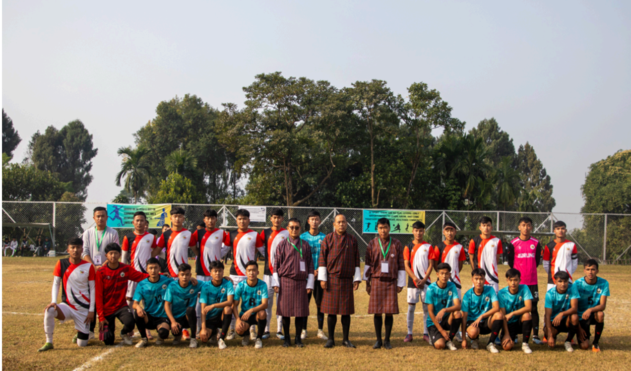
Figure 1. In the opening match, Men's Football match between – CNR and PCE