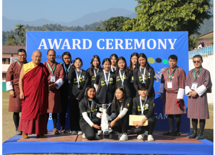
Figure 6. Glimpse of Basketball Final, Women (PCE winner, CNR runner-up)