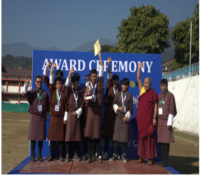
Figure 2. Glimpse of Archery Final (CLCS winner, JNEC runner-up)